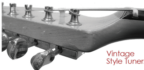
Vintage Style Tuners

The idea here is to relax the breaking point of the string as it crosses the nut, this decreases the load on the strings at the headstock. In most cases you'll have to wrap the low "E" string up the post and in some cases the "A" string as well. As you can see in the photos, the angle of the strings as they cross the nut to the tuners is about 10^{\circ} - 15^{\circ} .